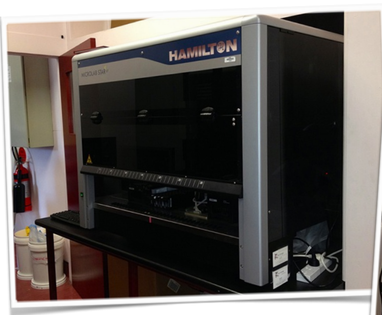
Hamilton 8 channel pipetting robot